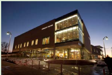
UMKC Student Union

Also being honored for community improvement and investment are the Kansas City Area Transportation Authority for the introduction of the Troost MAX bus rapid transit line, and Swope Community Builders and Swope Health Services for the opening of Swope Health South Community Medical Clinic.