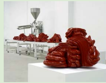
Roxy Paine. Scumak No. 2, 2001. Aluminum, computer, conveyor, electronics, extruder, stainless steel, polyethylene, Teflon, 90 x 276 x 73 in. (228.6 x 701 x 185.4 cm). Copyright the artist. Courtesy James Cohan Gallery, New York/Shanghai. Photo: Mitch Cope

Visit www.nelson-atkins.org for more information.