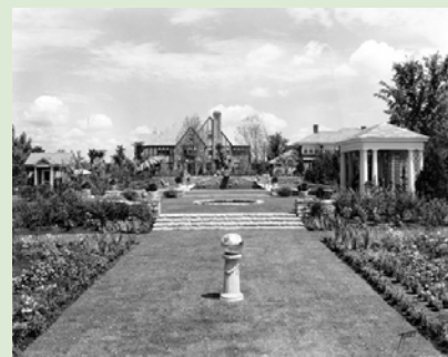
Dan Moser residence

The Century of Legendary Places exhibit celebrates the 100-year legacy of Hare & Hare. The firm is responsible for many of Kansas City's most iconic and highly visible architectural landscapes, such as the Country Club Plaza, the Nelson-Atkins Museum of Art, Loose Park, Ward Parkway and Mission Hills.